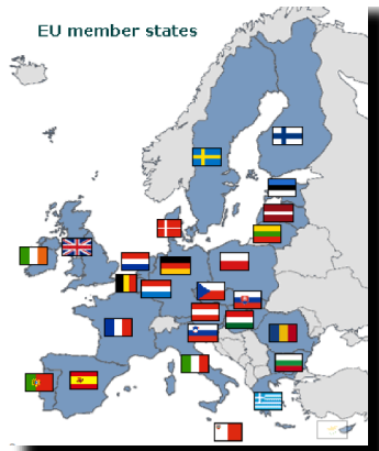
EU member states